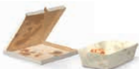
Dirty or greasy paper and cardboard