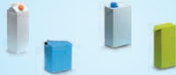
Milk, fruit juice, cream, tomato sauce...