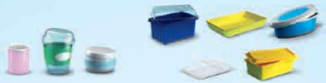
Pots and jars